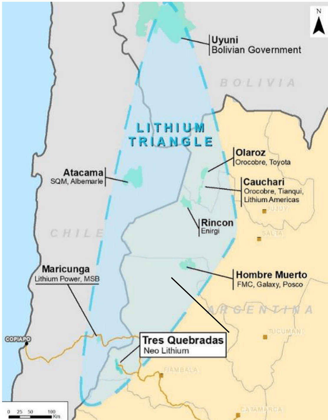
Figure 1: The Lithium Triangle

Xantippe looks forward to updating on its progress in Bolivia, including the introduction of potential technology partners to complement its growing and strategic land position in Catamarca, Argentina.