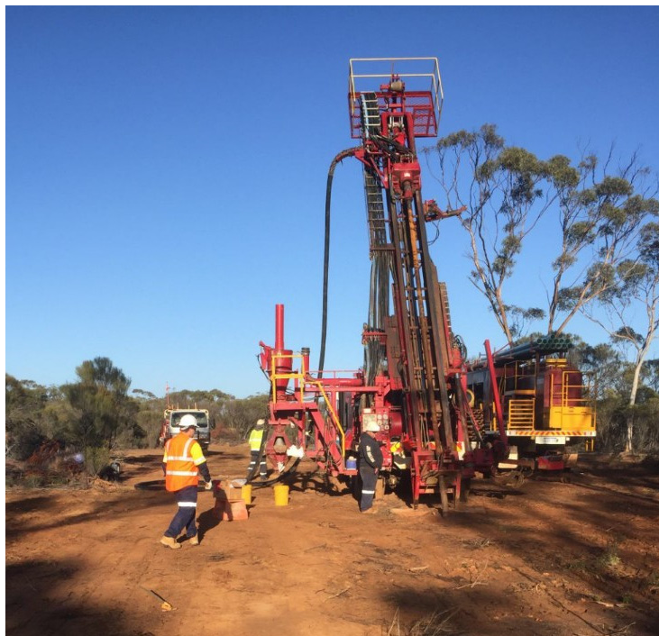
Figure 1: RC drill rig in operation at the Xantippe gold prospect